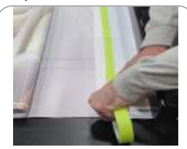
Place additional masking tape for extra protection.